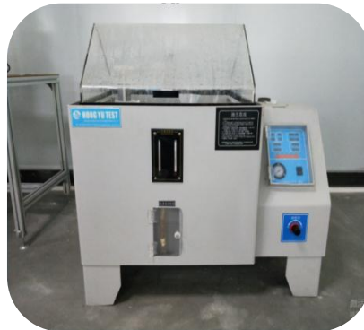
Salt spray tester