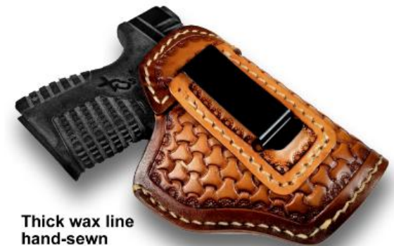
Thick wax line hand-sewn