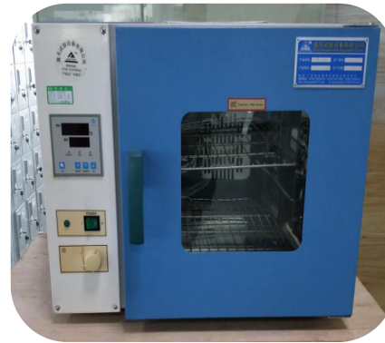
High temperature tester