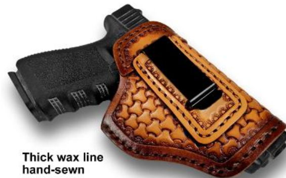
Thick wax line hand-sewn