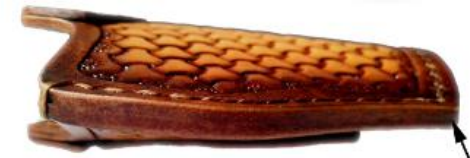
Smooth edging by hand