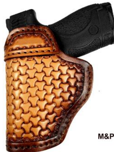
M&P Shield 9