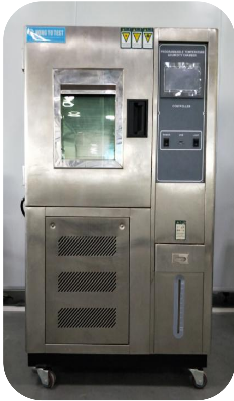
High-Low temperature tester