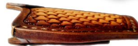
Smooth edging by hand