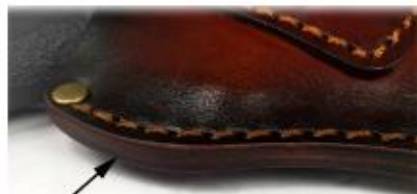
Smooth edging by hand