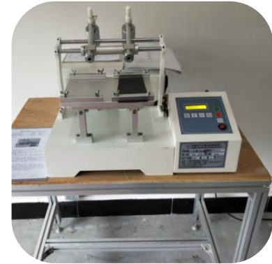
Croking/migration/ abrasion tester